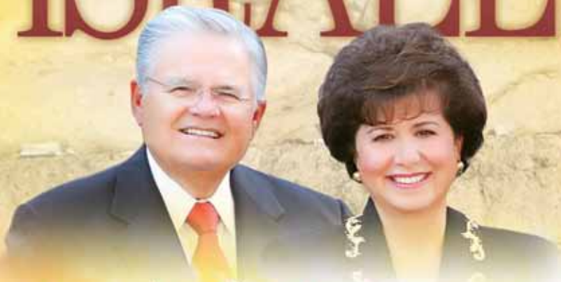
Pastor John & Diana Hagee