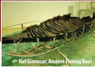
Nof Ginnosar, Ancient Fishing Boat