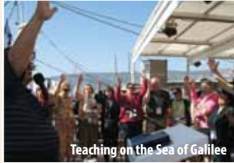
Teaching on the Sea of Galilee